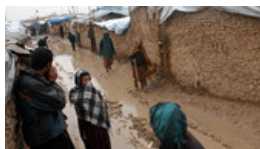
Afghans Flee Homes as U.S. Pulls Back