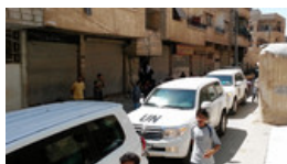
Syrian Regime Blocks Food to Gassed Town