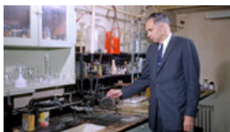
At Old Sites, Radioactive Questions Linger