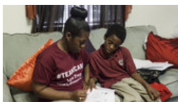
Inside the Nation's Biggest Experiment in School Choice