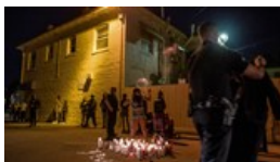
Cities Use Sticks, Carrots to Rein In Gangs